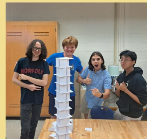
Engineering Tomorrow's Innovators